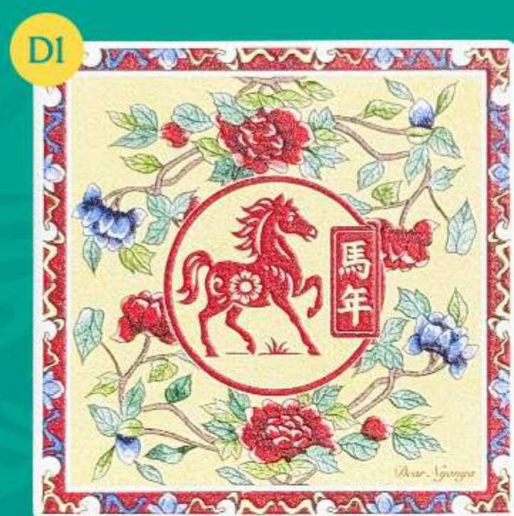
Year of Horse